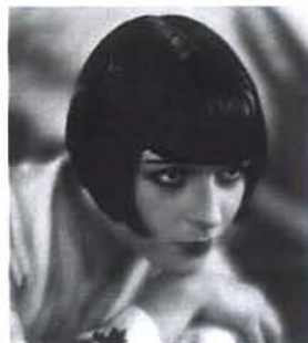
Louise Brooks "She made an enormous impression and the whole flapper thing was marvellous."