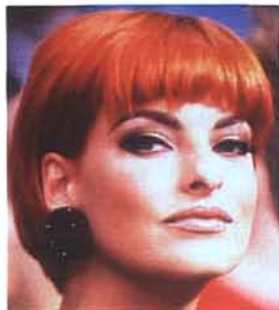
Linda Evangelista "The first model to keep changing her look and inspire others to do the same."