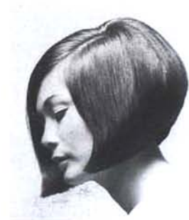
Nancy Kwan "People are still wearing her look and she was so beautiful – nobody wore it better!"