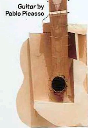
Guitar by Pablo Picasso