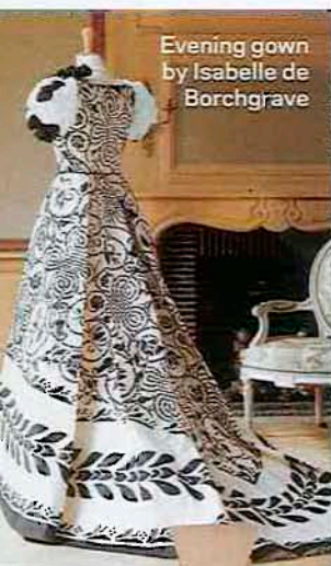
Evening gown by Isabelle de Borchgrave